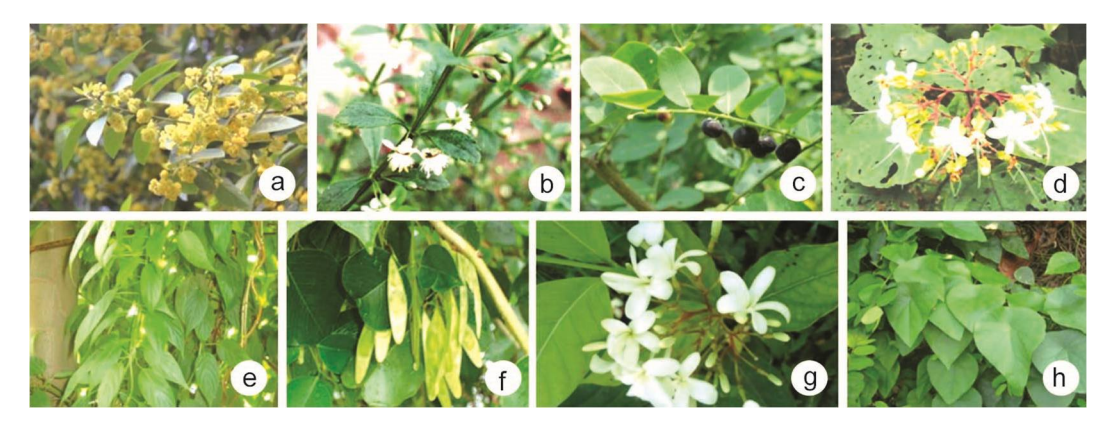
Fig. 1. Selected ethnomedicinal plants for antibacterial activity. (a) Litseaglutinosa (Lour.) Robinson, (b) Scoparia dulcis L. (c) Phyllanthus reticulatus Poir. (d) Clerodendrum viscosum Vent. (e) Paederia foetida L. (f) Dalbergia sissoo Miq. (g) Holarrhena antidysenterica (L.) Wall. ex Decne. (h) Stephania japonica (Thunb.) Miers.